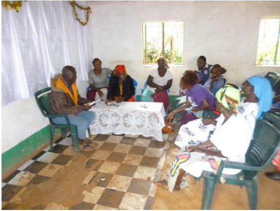
WIDOWS TABLE BANKING