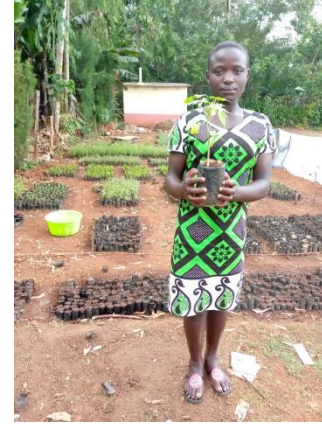
YOUTH TREE NURSERY