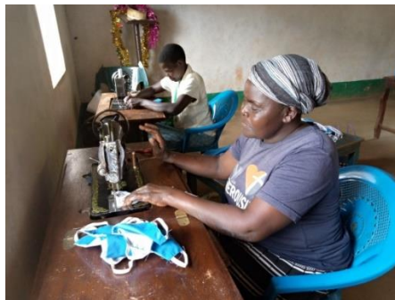
WIDOWS MAKING FACE MASKS