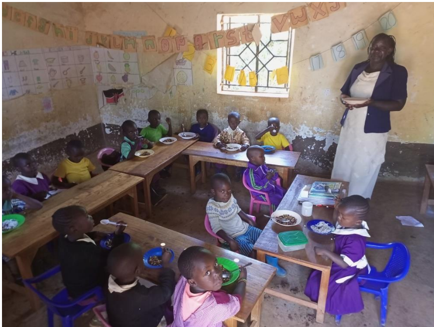
Feeding Programme goes on at Barbara Academy.