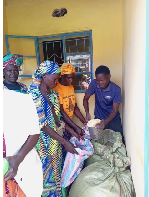
Relief Food Distribution to the Widows.