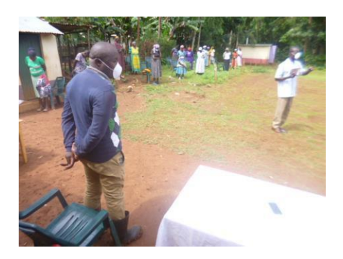
The area chief witnessing food distribution

The impact has been felt in the entire community and the Government has highly appreciated what we have done. The Area Asst.Chief attended one of our relief distributions days and appreciated the effort we made. He was impressed by the way distributions was done - health rules are strictly followed.