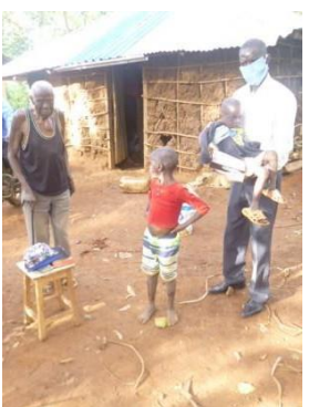
Showing love to the hopeless. With the announcement by the government that all must wear face masks or else they face arrest, we had to go extra miles to provide face masks as the poor cannot afford to buy the mask if they lack even what to put on the table.