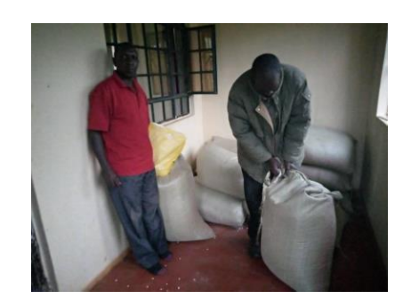
Christ Ministers Fellowship Pastors came to pick donations for their needy church members