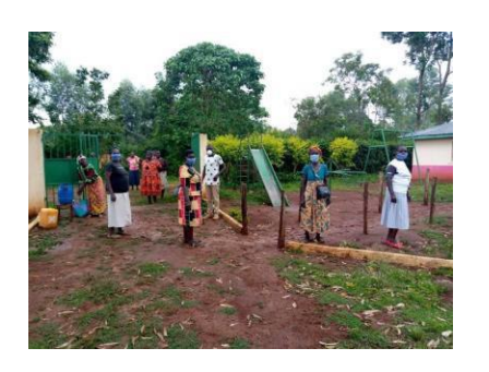
Lining up, keeping social distance rule.