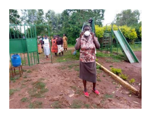
Putting on face mask